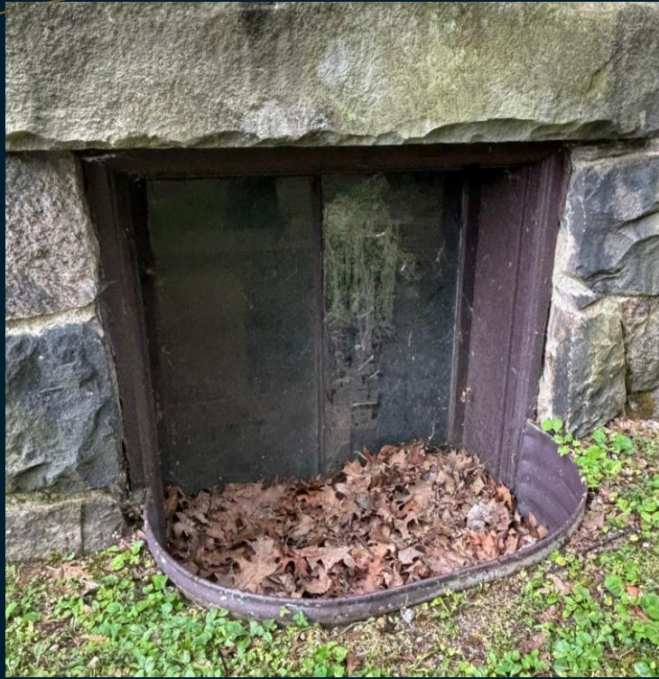
NORTH VIEW LOWER-LEVEL WINDOW