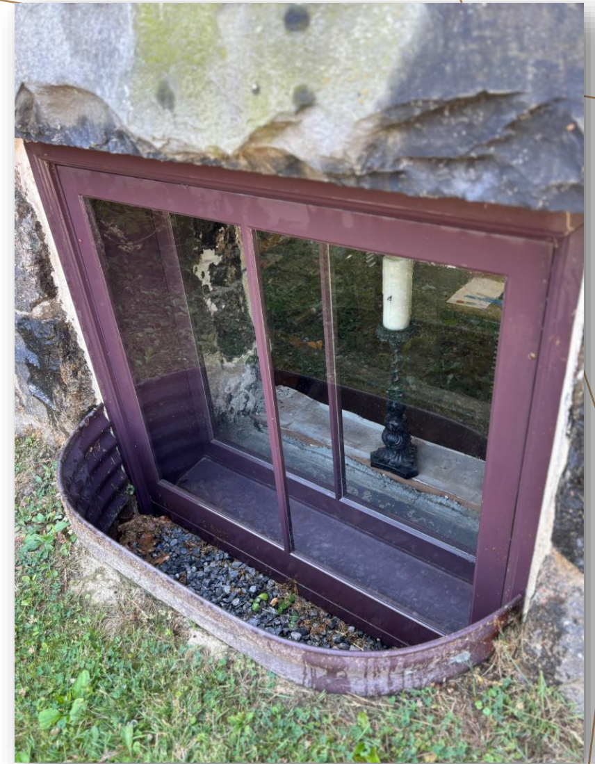
RESTORED WINDOW WITH STORM NYSCA FUNDED RESTORATION OF 12 WINDOWS IN 2023