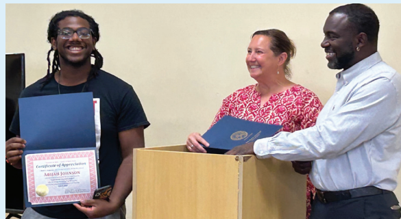
Recognition of completion of the Climate Connections Project