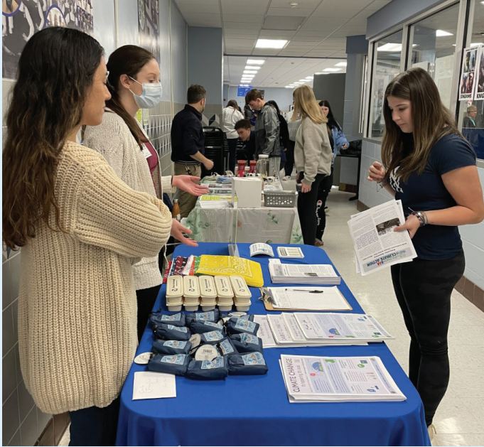
Kenmore West High School's Earth Week event