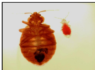
Adult bed bug with nymph

• A newly hatched bed bug or nymph is semi-transparent, light tan in color, and the size of a poppy seed. Adult bed bugs are flat, are rusty red in color, have oval bodies, and are about the size of an apple seed.