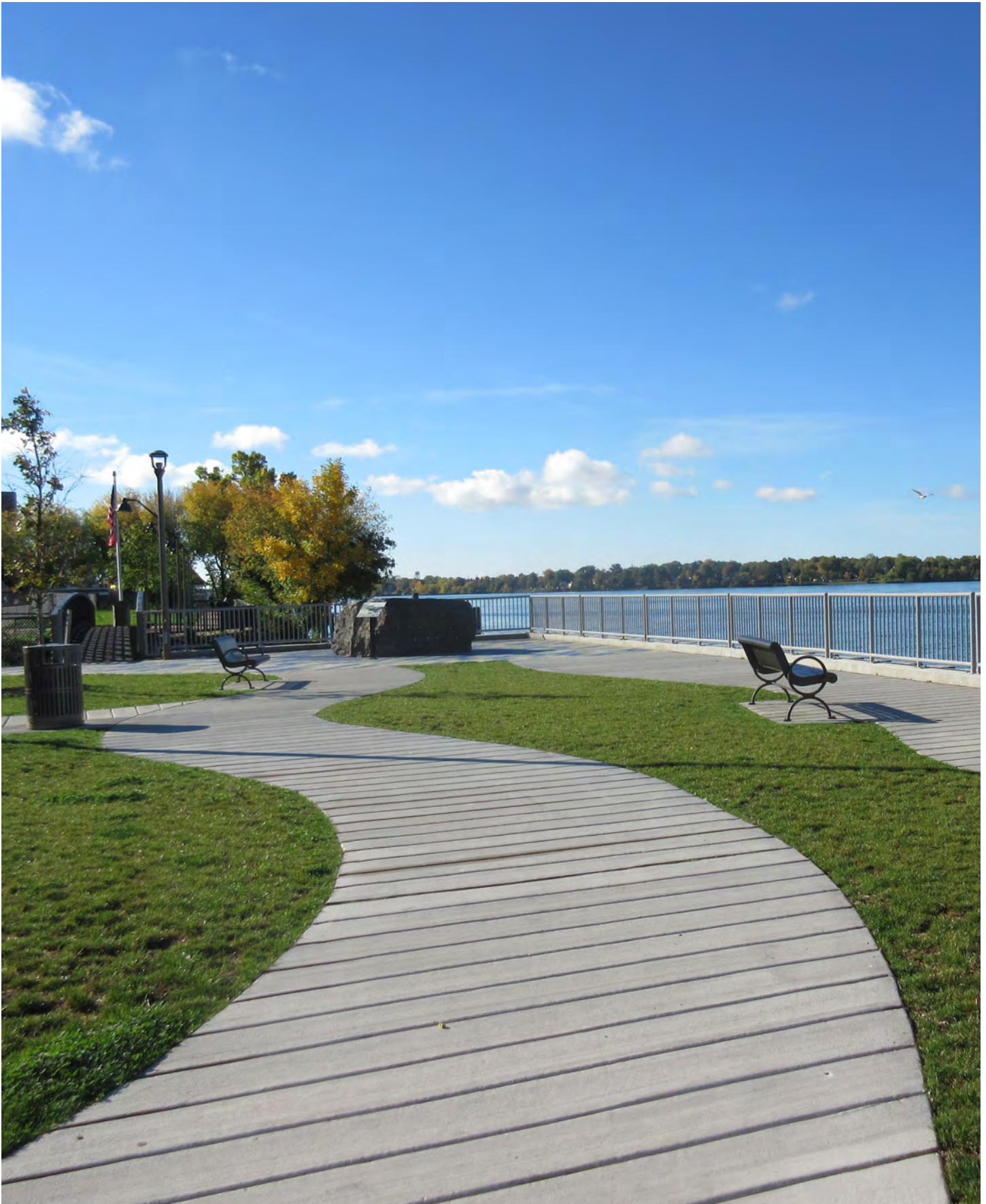
Meandering path at the waterfront