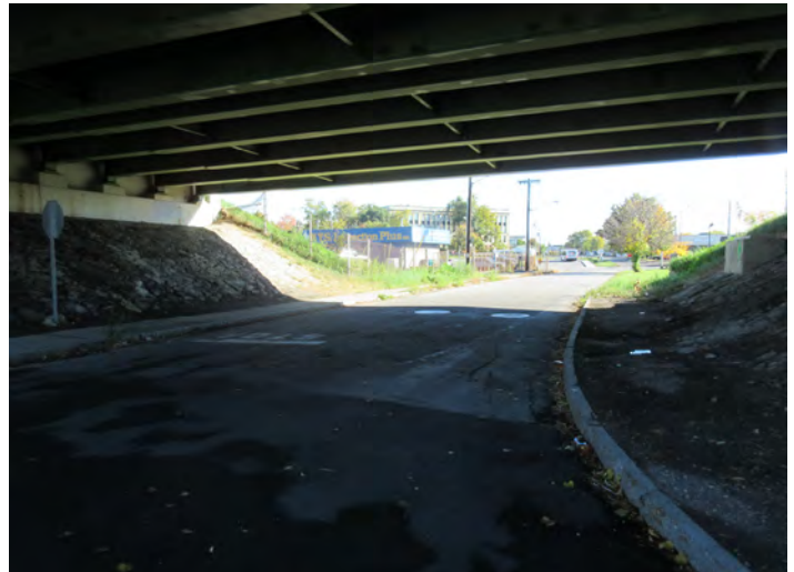
Conditions under the I-190