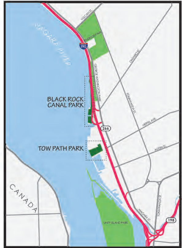
Local context map