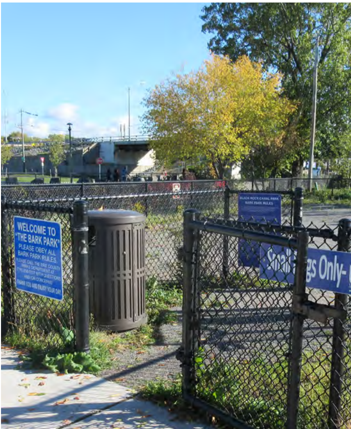
Frequent maintenance issues at the Bark Park