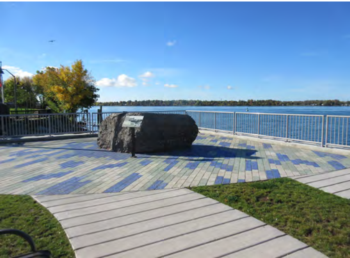
Black Rock interpretive area