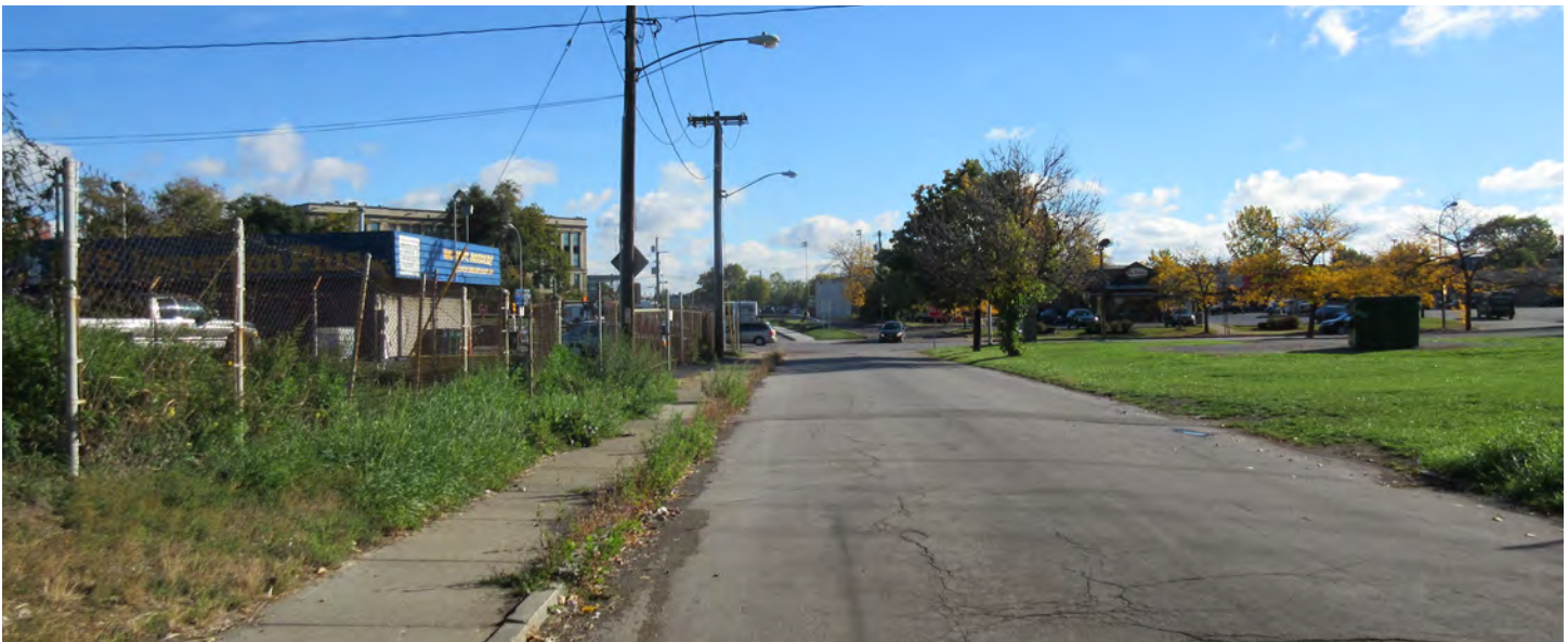
Sidewalk connection to Niagara Street