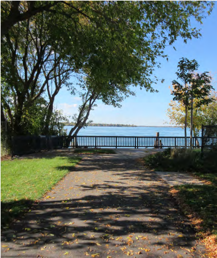
View towards the Niagara River