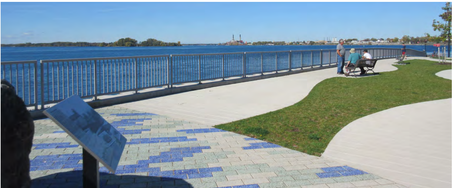
Promenade on a warm sunny day