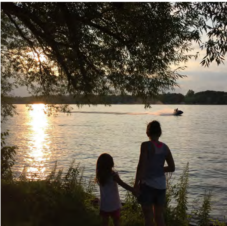
Sunset over the Niagara River