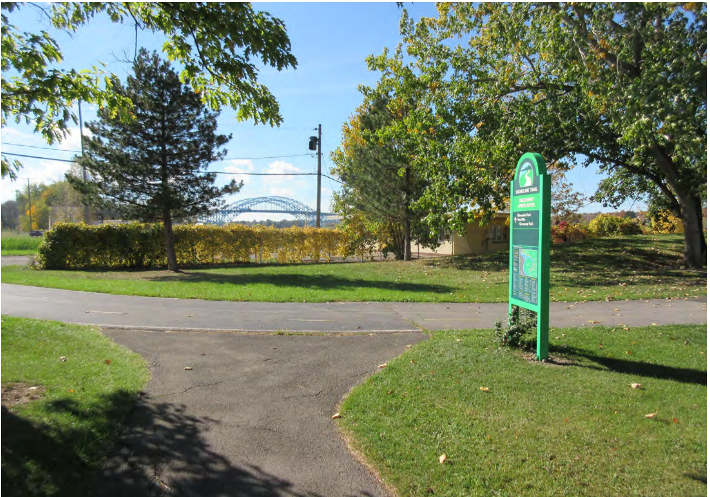
Shoreline Trail signage as you enter the Isle View Park