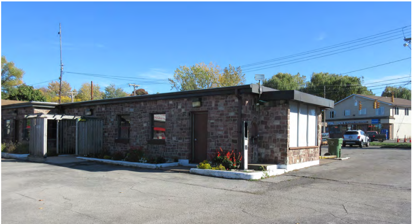
Parks office and maintenance building