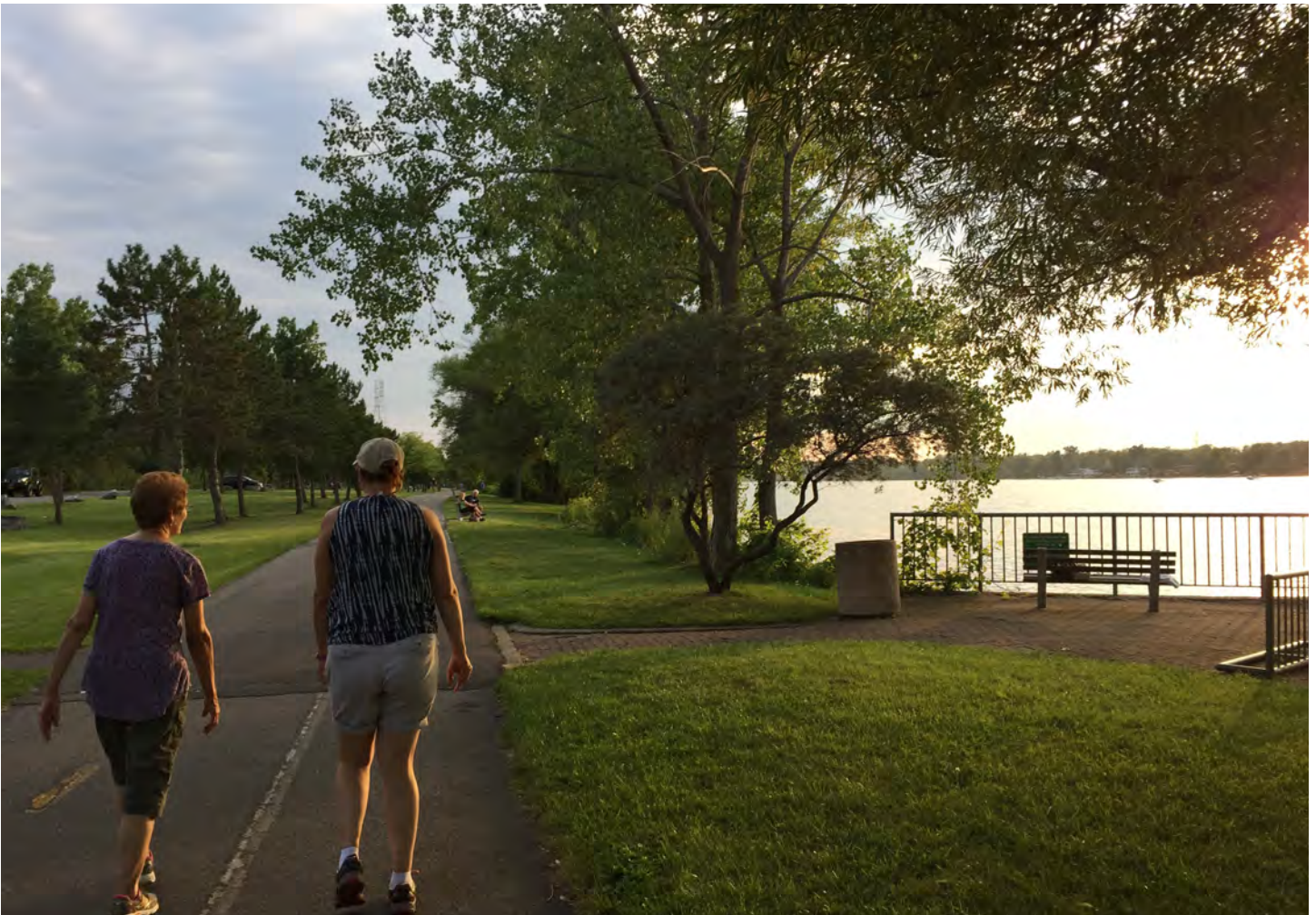
The trail at Isle View Park is very popular over the summer