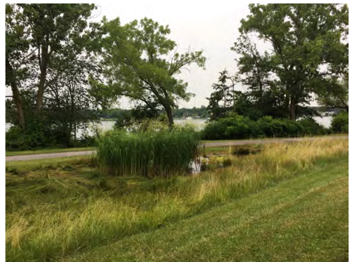
Natural area within the park