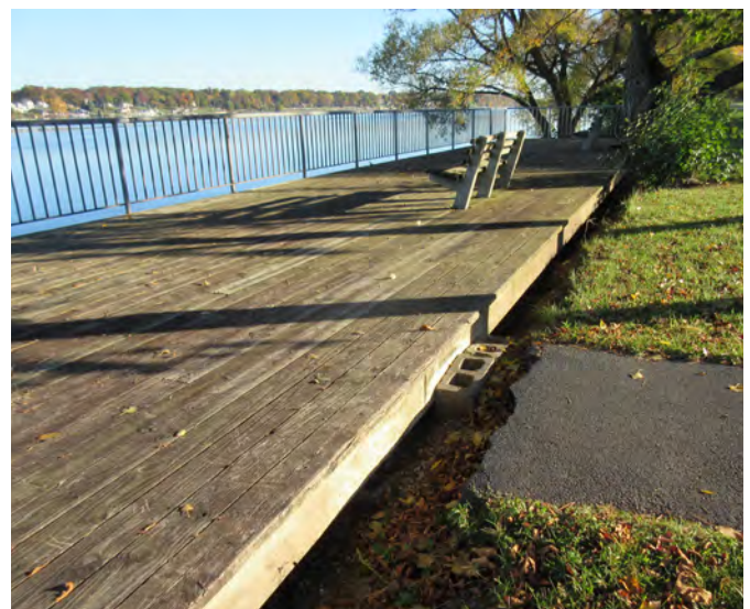
Section of asphalt path missing