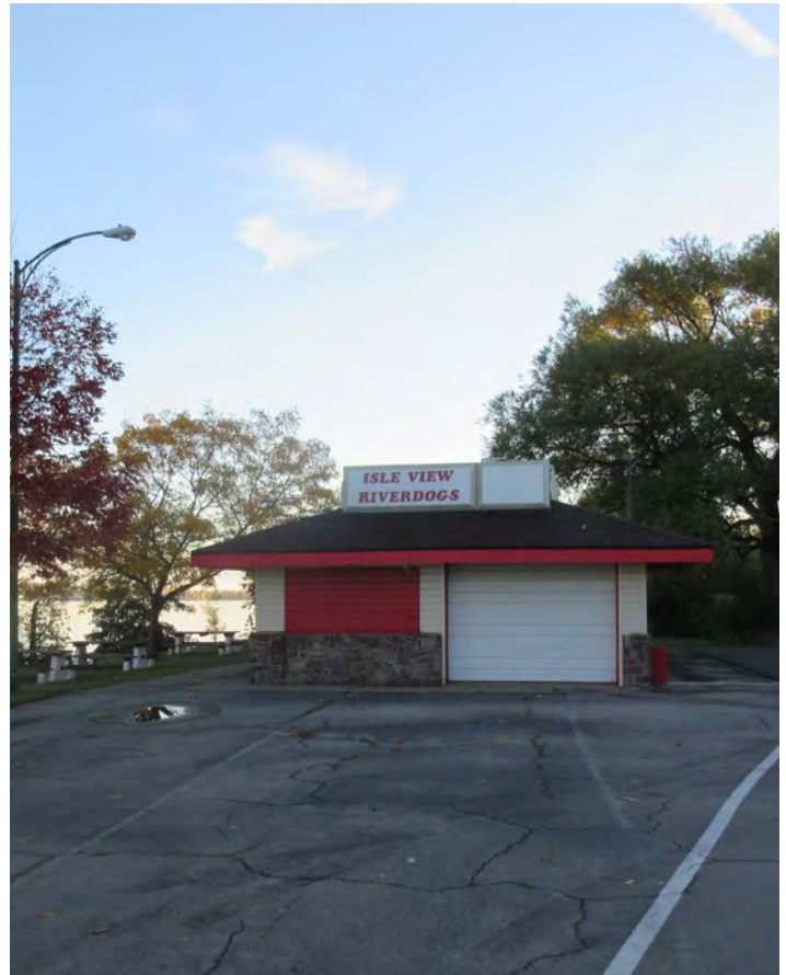
Isle View Riverdogs: Restore and revert to shelter