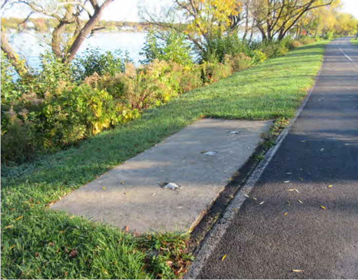
Former location of a bench which was removed; Replace with new bench