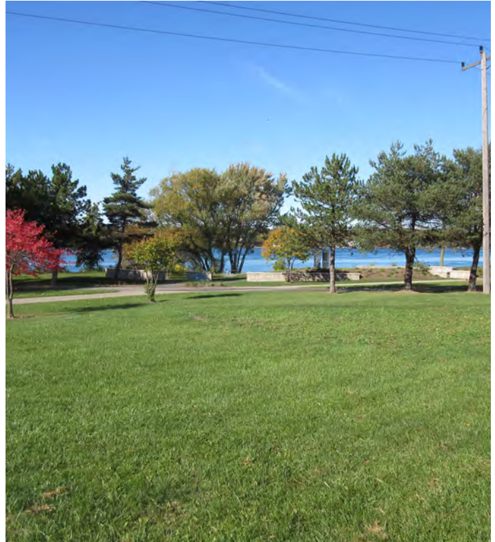
View towards the Tribute Garden