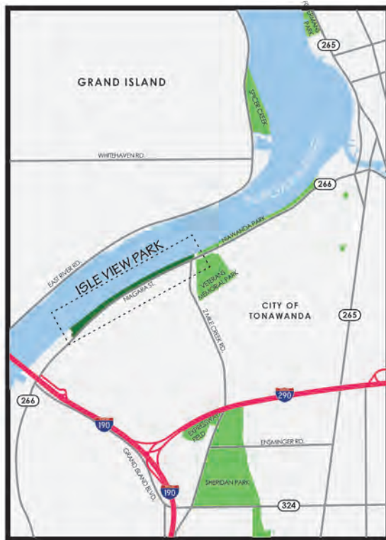
Local context map