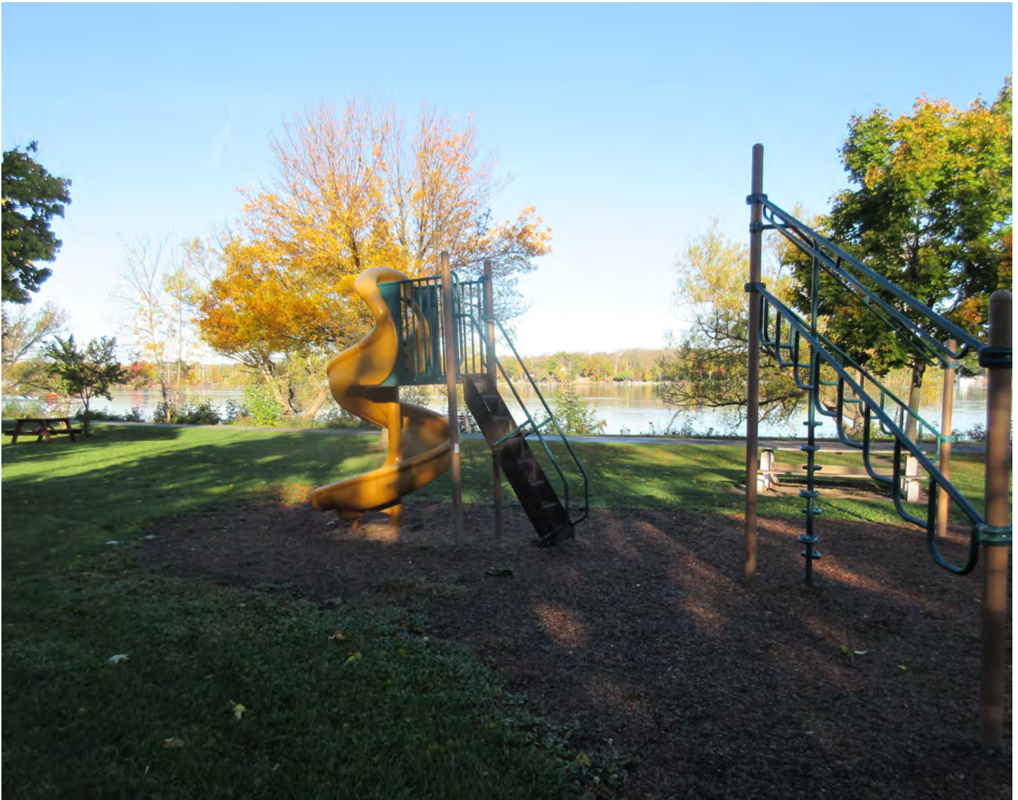
Small playground with swings