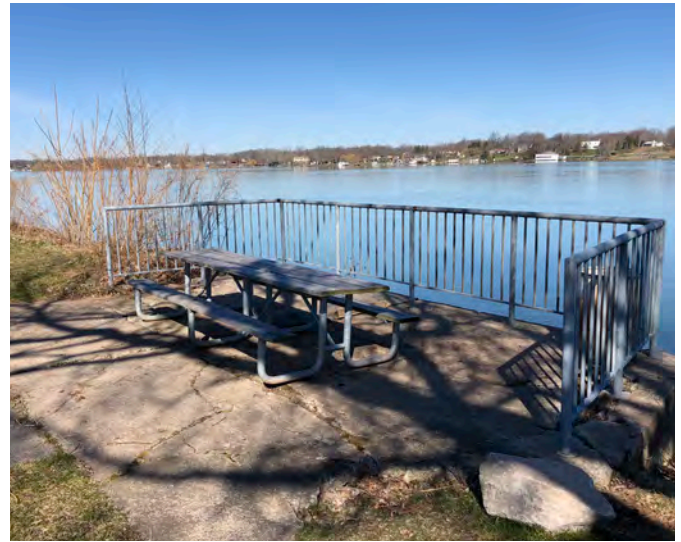
Overlook area: Restore/repair pavement