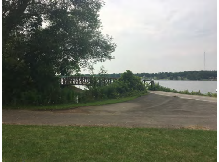
Bridge from Isle View to Niawanda Park