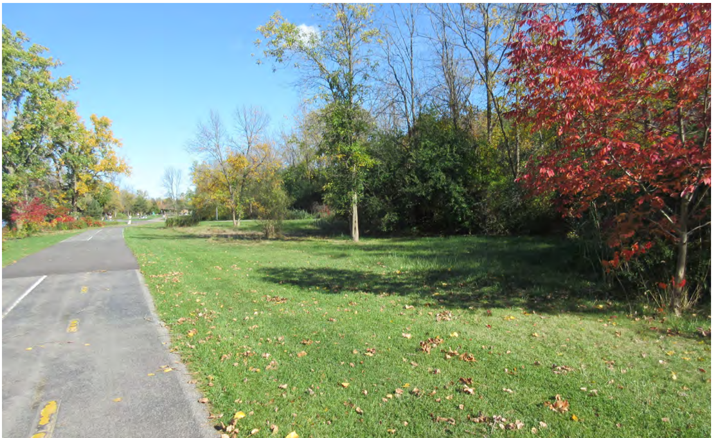
Shoreline Trail/Riverwalk within the park