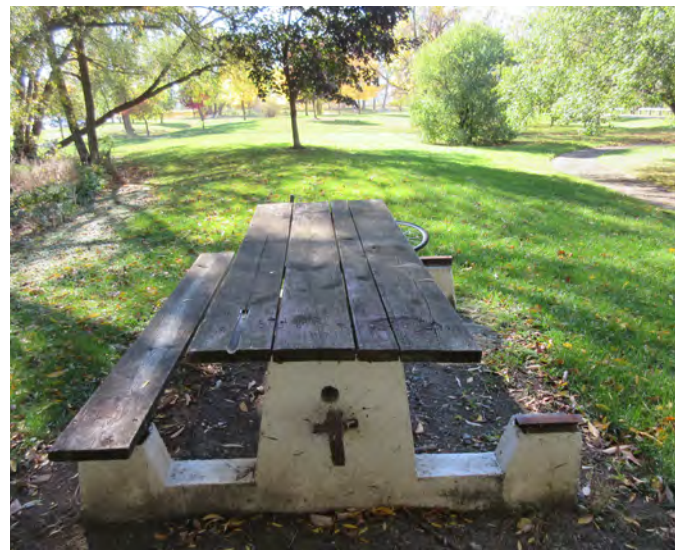
Several picnic tables throughout the park resemble this one, and should be replaced