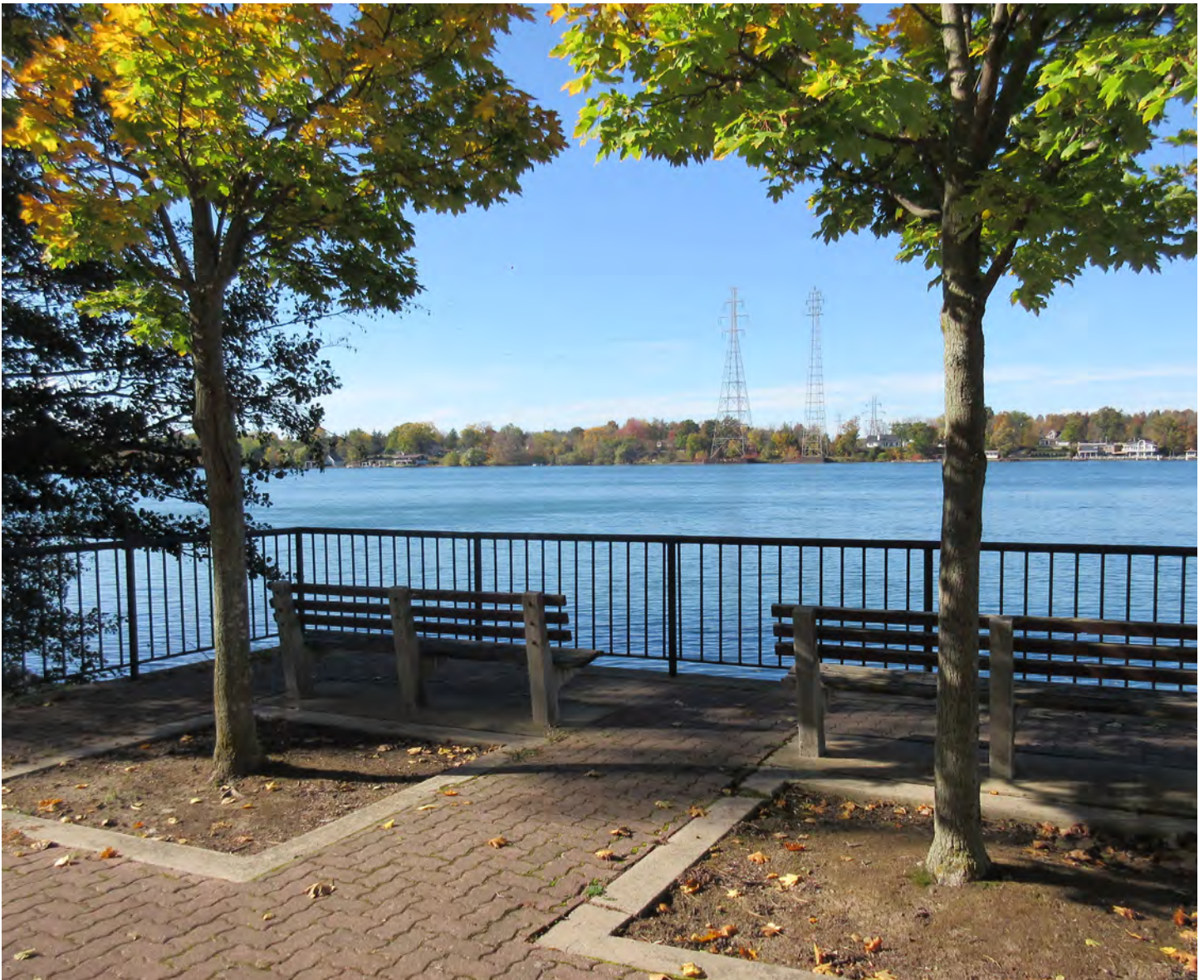
Overlook with benches