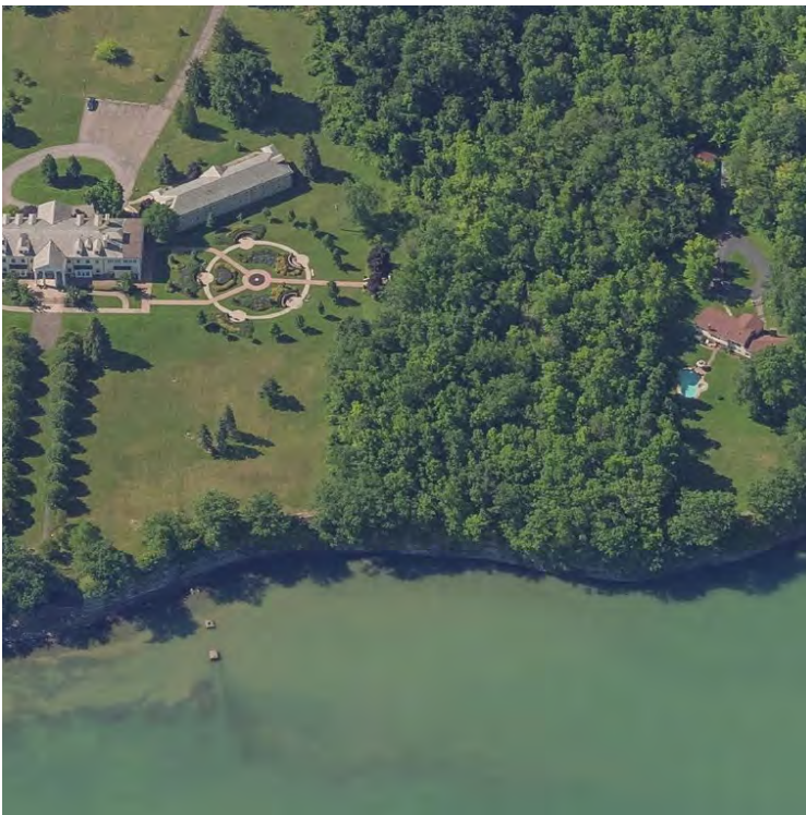
Aerial view of the north side of the property which features a large bluff overlooking the Lake