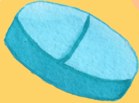
Not actual pill size

To learn more about PrEP, scan the QR code to visit the CDC's website on PrEP.